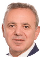
COSTAS MAVRIDES (S&D)

Member of the European Parliament's delegation to the plenary of the Conference on the Future of Europe