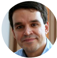
DR IOANNIS N. GRIGORIADIS

Minister of Foreign Affairs, Republic of Cyprus